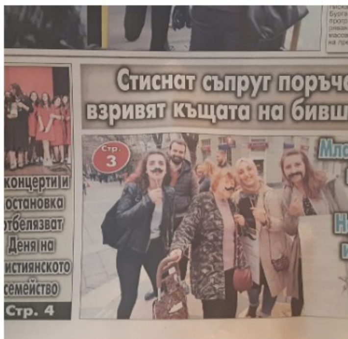
A photo of the movember event is in the newspaper.